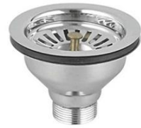
Full Steel Waste Coupling Model No : RNS-8091 Brand Name : FANTUS