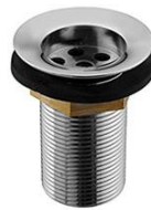
Wash Basin Coupling (Steel) Model No : RNS-9051 Brand Name : FANTUS