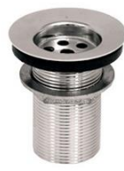
Steel Wash Basin Coupling Model No : RNS-9081 Brand Name : FANTUS