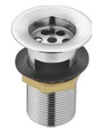
Wash Basin Coupling (Brass) Model No : RNS-9061 Brand Name : FANTUS