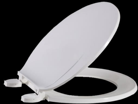
European Solid Seat Cover Model No : RNS - 3001 Brand Name : FANTUS