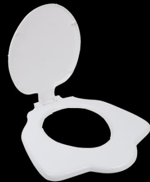
Anglo Indian Seat Cover Model No : RNS - 7001 Brand Name : FANTUS