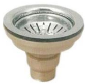
Royal Coupling Model No : RNS-8071 Brand Name : FANTUS