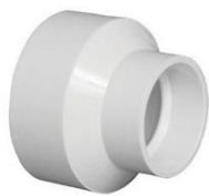
Waste Coupling Reducer Model No : RNS-9041 Brand Name : FANTUS