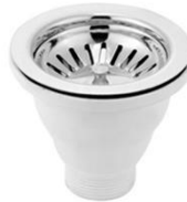
White Matka Coupling Model No : RNS-8071 Brand Name : FANTUS