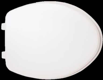
Light Toilet Seat Cover Model No : RNS - 2001 Brand Name : FANTUS