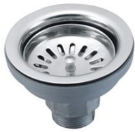
Flower Waste Coupling Model No : RNS-9011 Brand Name : FANTUS