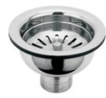
FANTUS Premium Waste Coupling Model No : RNS-8051 Brand Name : FANTUS