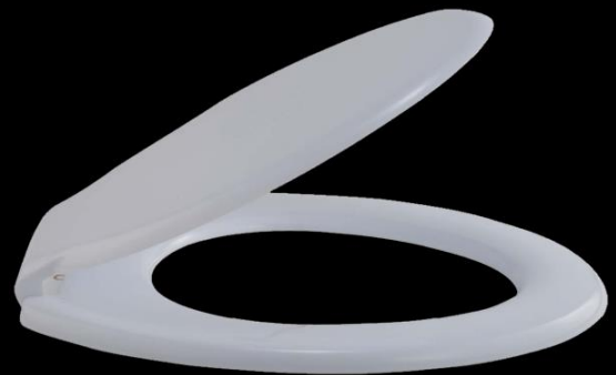
EWC With Jet Spray Seat Cover Model No : RNS - 5001 Brand Name : FANTUS