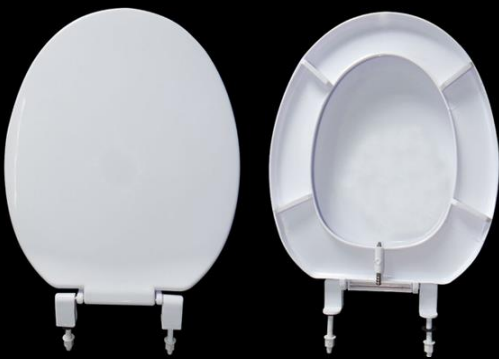
EWC Without Jet Spray Seat Cover Model No : RNS - 4001 Brand Name : FANTUS