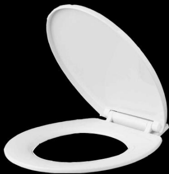
Soft Closer Seat Cover Model No : RNS - 6001 Brand Name : FANTUS