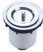
Basket Waste Coupling Model No : RNS-8081 Brand Name : FANTUS