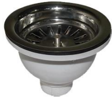
Fantus Matka Waste Coupling Model No : RNS-8061 Brand Name : FANTUS