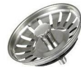
Waste Coupling Stopper Model No : RNS-9031 Brand Name : FANTUS